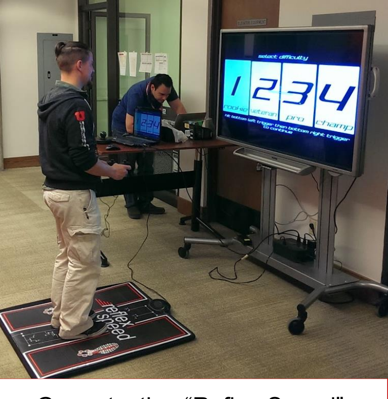
Game testing "Reflex Speed"