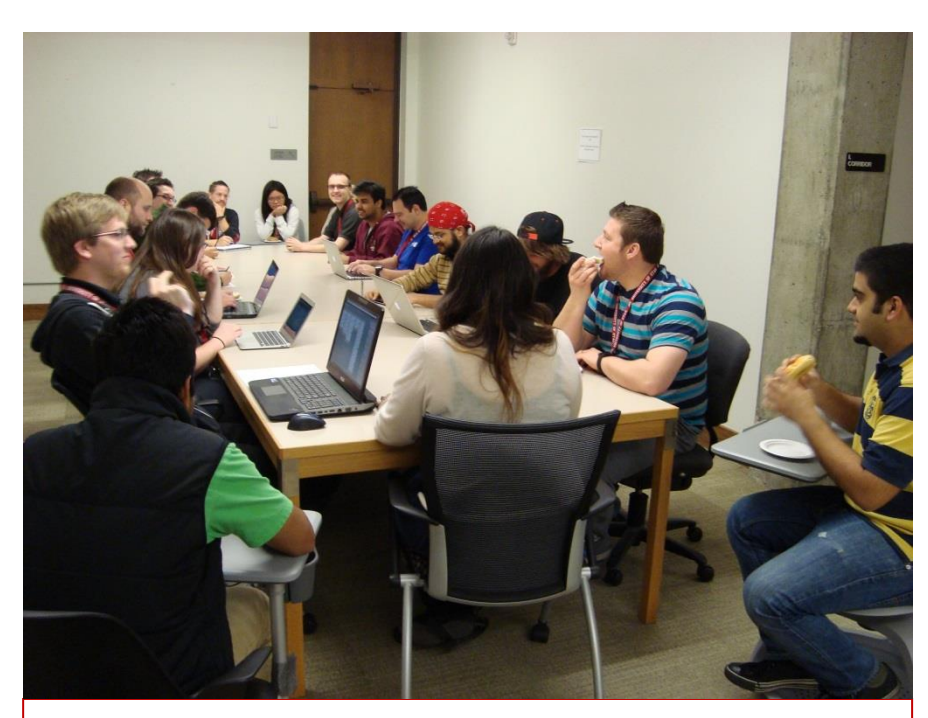
The GApp Lab's "All-Hands Meeting".

Eccles Health Sciences Library* hosts and the Center for Medical Innovation** sponsors students that develop medical therapeutic devices (MTD– gaming and products) and health applications. MTDs are a fairly new, yet vital, source of financial income. Librarians guide the inclusion of evidence-based knowledge into these devices.